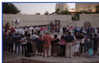
In Jerusalem, members of the ACC and GTM gather together for song and prayer.

Each day included services held in beautiful settings, from the Southern Wall in Jerusalem's Old City, to the gardens of the Leo Baeck Institute, to the architecturally superb grounds of Beit Daniel and the Hebrew Union College. With different cantors and musicians leading each prayer service, and a congregation full of