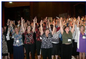
ACC/GTM members enjoy a memorable concert at their 2009 Convention in Chicago.

Ayelet Tours was proud to coordinate the American Conference of Cantors (ACC) and Guild of Temple Musicians (GTM) June 2009 Convention in Chicago, IL.