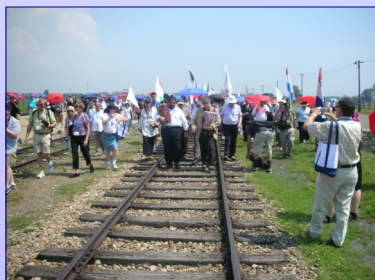
Hundreds of CA Mission participants walk down the tracks of the Birkenau concentration camp in Poland

The mission traveled from Poland to Israel, where their days were filled with concerts, ceremonies, and focused touring opportunities.