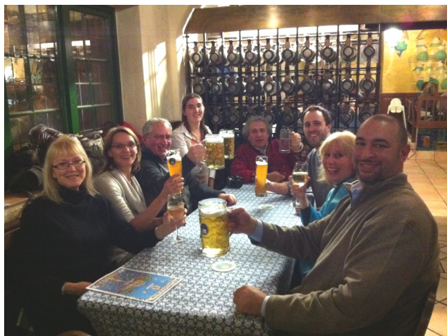
Ayelet Staff celebrates a successful tour in Germany.

Contact Ayelet Tours or visit our website for more information on the upcoming CA Mission, or to plan your own congregational Mission to Germany today!