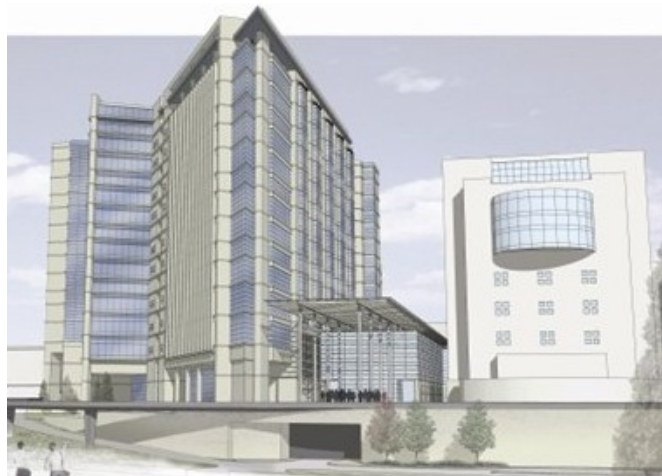
The Design for the Sarah Wetsman Davidson Hospital Tower at Ein Kerem

Ayelet Tours will be coordinating 21 optional pre- and post-convention tours, including visits to Petra, Jordan, a 3-day spa visit, and specialized extensions for attorneys, physicians and nurses.