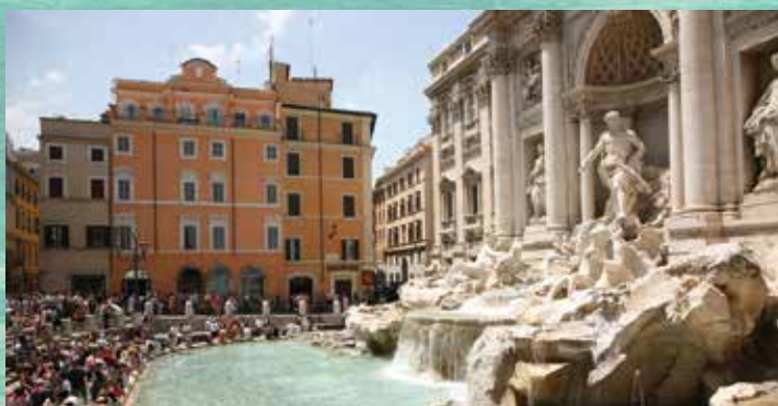
Trevi Fountain - Rome, Italy