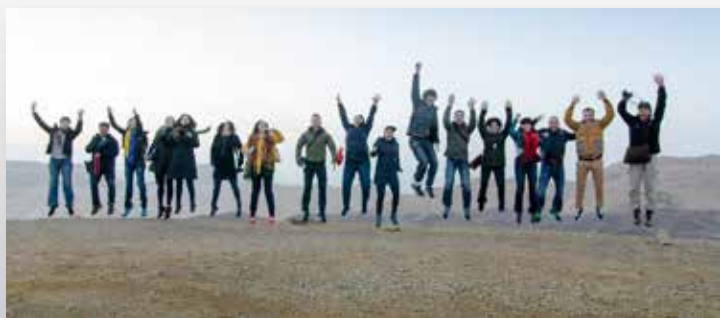
COJECO BluePrint Fellowship jumps into the groove! Negev desert, Dec 2014