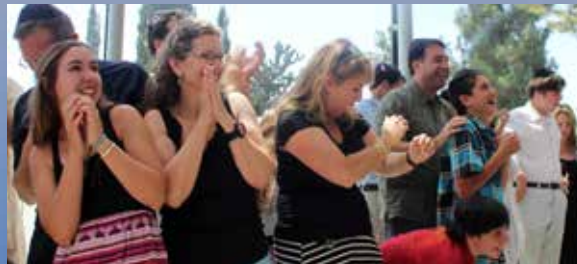
The perfect way to mark your simcha - Celebrating in Israel!