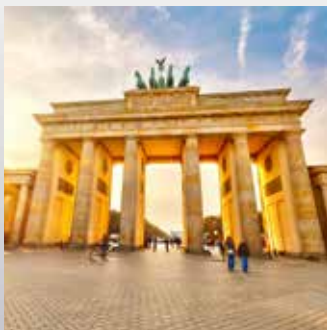
Brandenburg Gate, Berlin, Germany