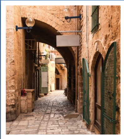
Old City Jerusalem