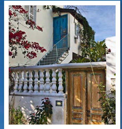
Old Tel Aviv