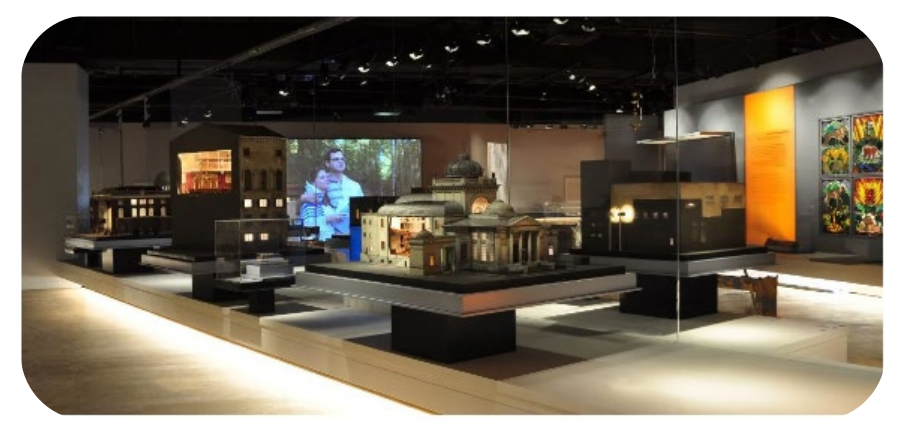
exhibit focuses on the unique music, melodies, art and food of the different communities.