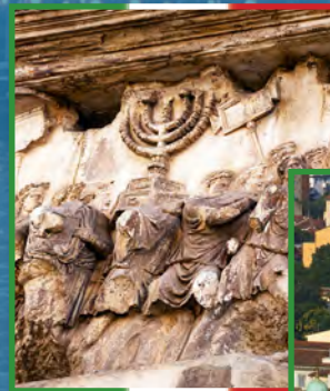
Arch of Titus, Rome