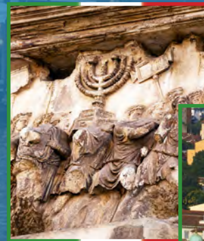
Arch of Titus, Rome