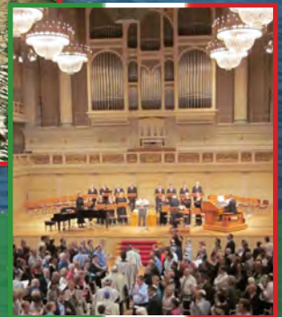
Cantors Assembly concert - Spain 2016