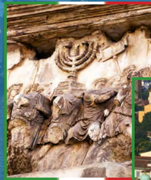
Arch of Titus, Rome