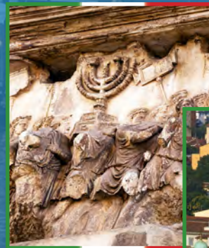
Arch of Titus, Rome