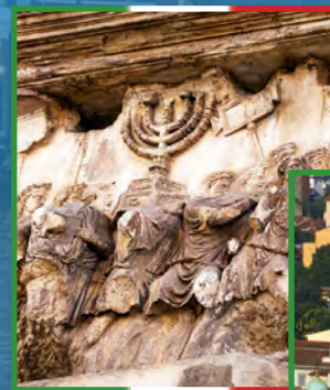
Arch of Titus, Rome