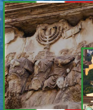
Arch of Titus, Rome