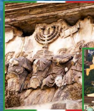
Arch of Titus, Rome